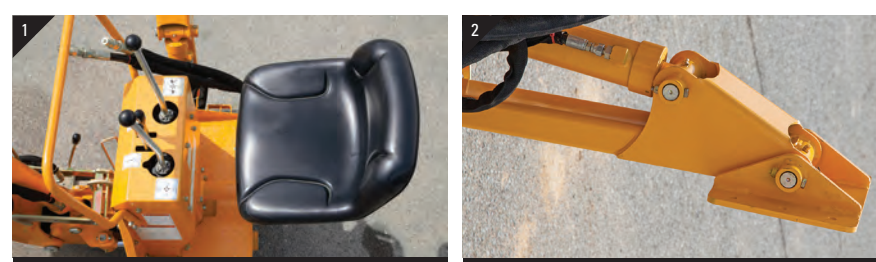
Convenient levers for enhanced efficiency and a seat with a broad operating radius for easy manoeuvring