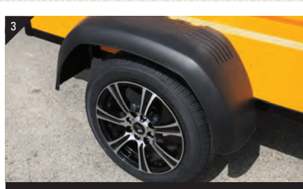
Fenders to protect cargo from road dust and other debris