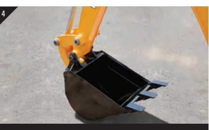
Optional high-strength bucket for stable work