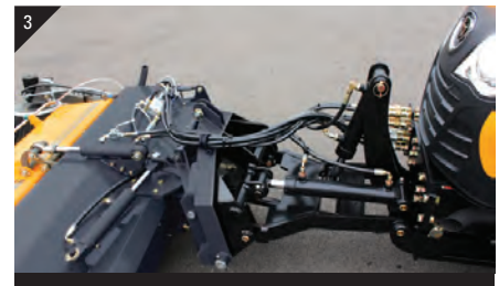
Left-right manoeuvrability provided by hydraulic cylinder which can be simply attached to the tractor's front end

Hydraulic hopper allows independent use of main brush