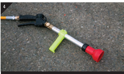
Sprayer with a maximum range of 15m which increases the effectiveness of closerange spraying