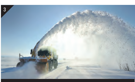
A powerful fan equipped to the central snow collector allows long-range snow discharge ( over 10m )

Outstanding performance and sturdy durability make it ideal for removing large amounts of snow