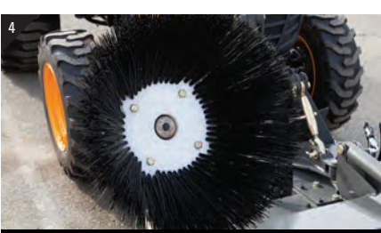
A brush with simple maintenance and service which can easily be replaced by anyone