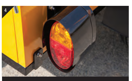
Turn signals connected electronically to the main tractor