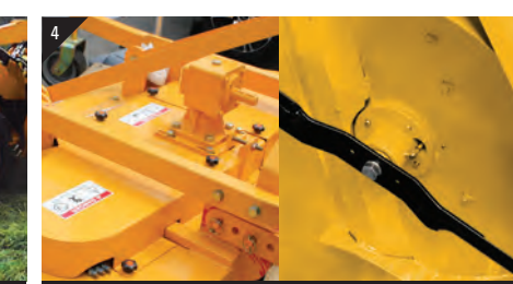
Gearbox and cutting knife with proven durability in the North American market