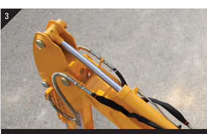
Sturdy boom and arm with high-pressure hydraulic cylinders for maximum durability and no bending or distortion