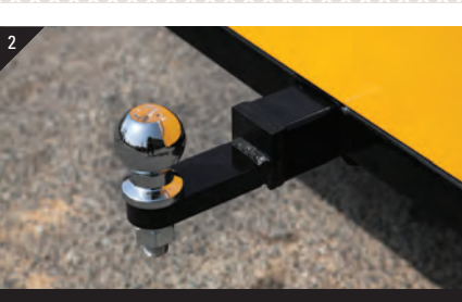
Hitch ball on the back of the trailer allows it to be connected to other equipment and trailers can be connected with multiple connections