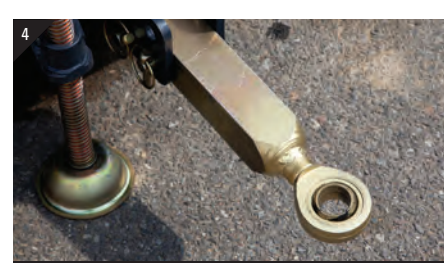
Equipped with a link for easy attachment to and removal from tractor

Folding hydraulic support to fix the lift body in place